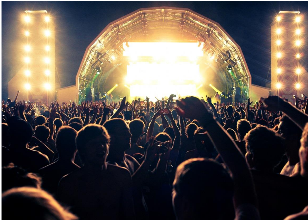
CONFERENCES & MEETINGS WEEK